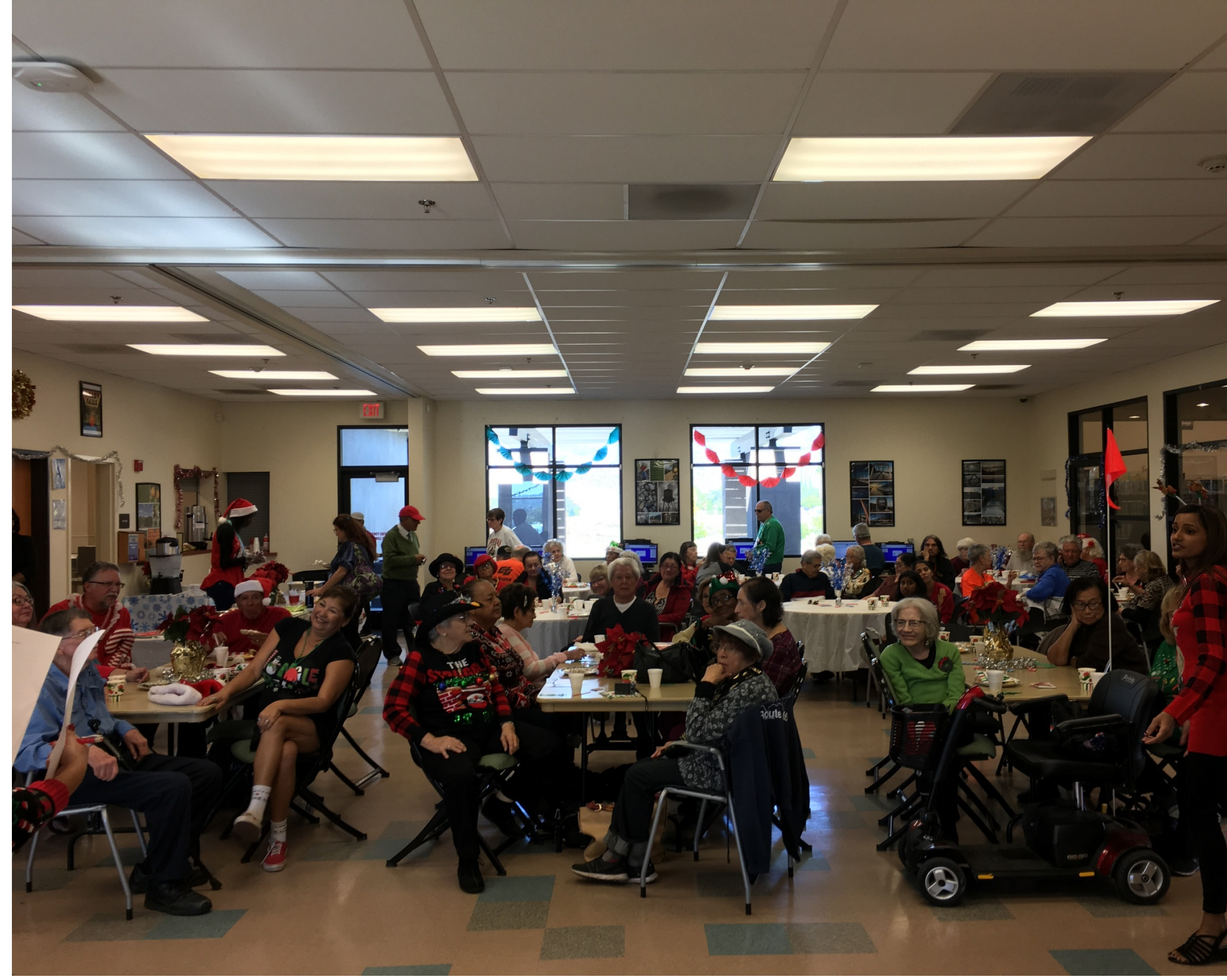
The Senior Center's party on December 19.